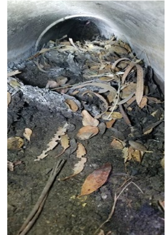
Inside of a culvert pipe that is partially blocked with debris that could lead to backup and flooding

Storm drainage maintenance should be done prior to the rainy season and then as-needed throughout the season. Especially in rural, forested areas like Woodside, a significant amount of silt and vegetation is carried into storm drain systems by storm runoff, especially early in the storm season. It is important to reinspect and clear drainage